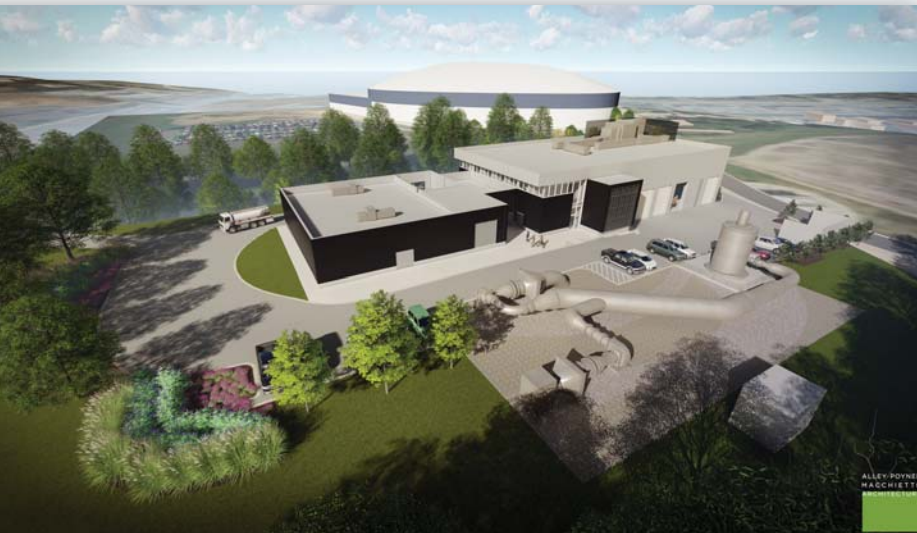
Saddle Creek Retention Treatment Basin rendering.