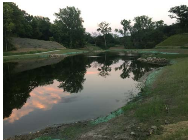
Spring Lake Pond – September 2016