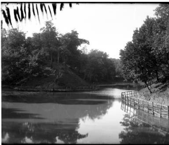
Syndicate Park in the 1900's

If you have questions please visit our website at www.omahacso.com or call the hotline at 402-341-0235.