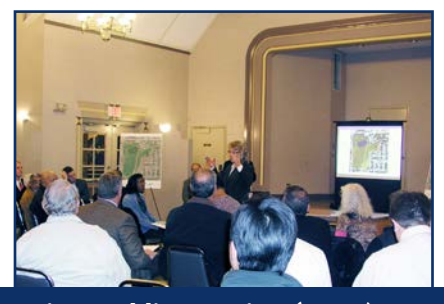
First Public Meeting (2012)