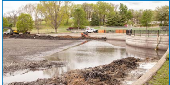
Construction (May 2017)