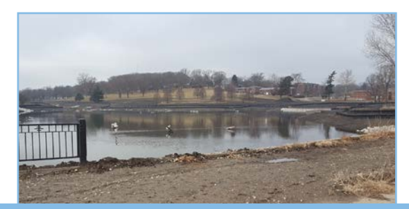
Construction (March 2018)