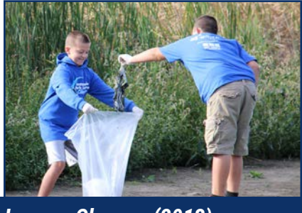
Lagoon Cleanup (2013)