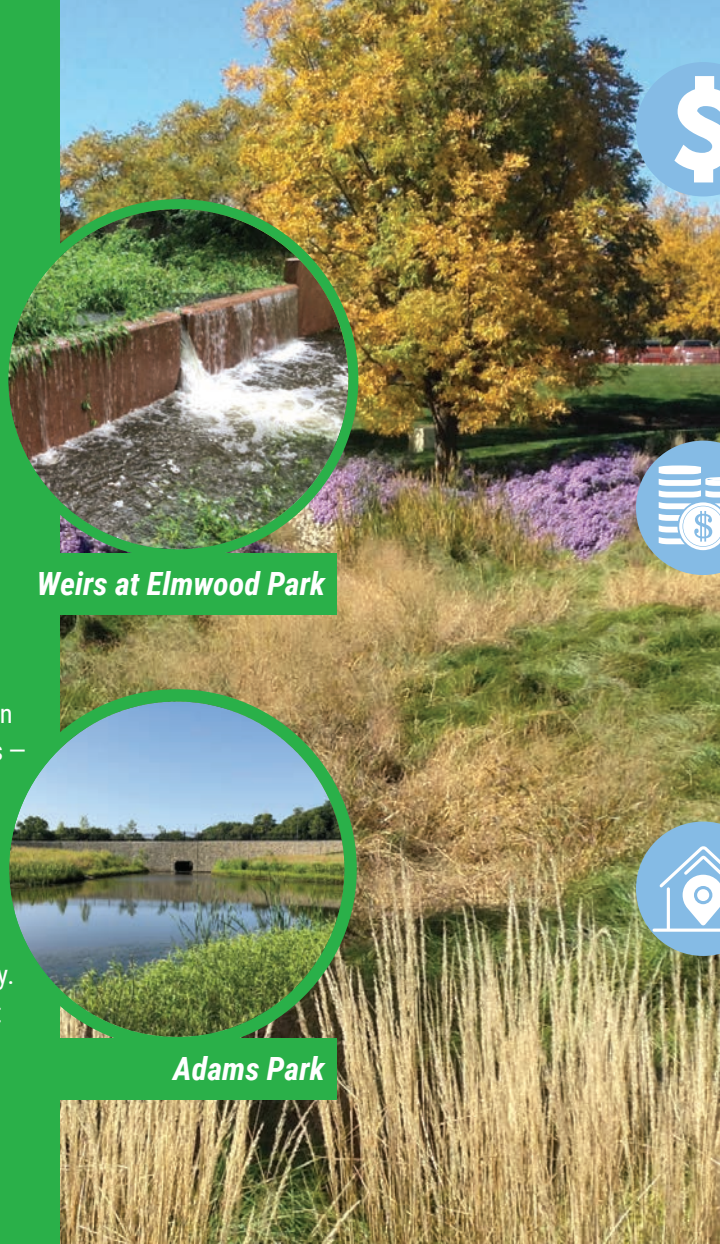
Weirs at Elmwood Park