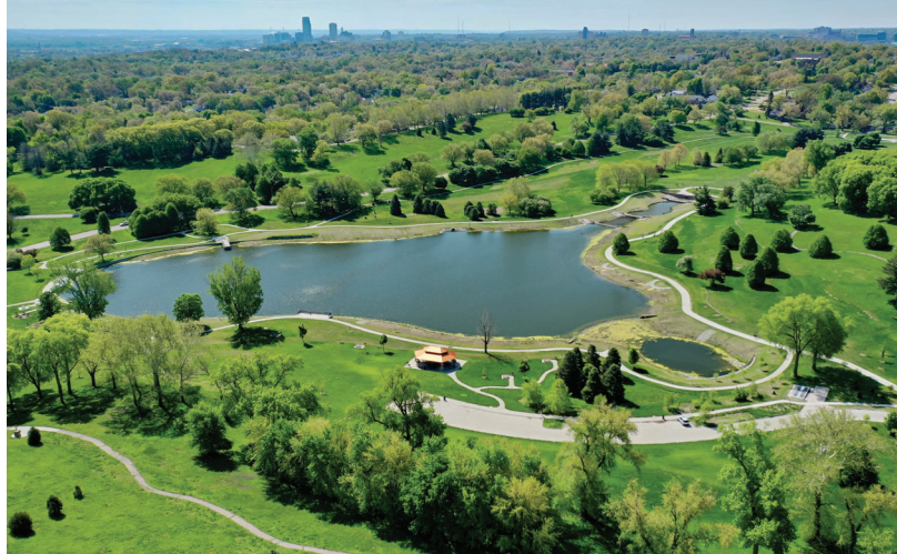
Fontenelle Park Lagoon Improvements