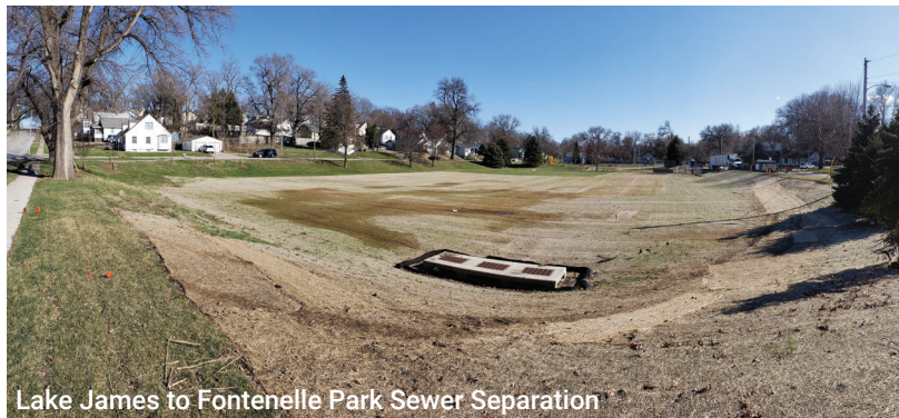
Lake James to Fontenelle Park Sewer Separation